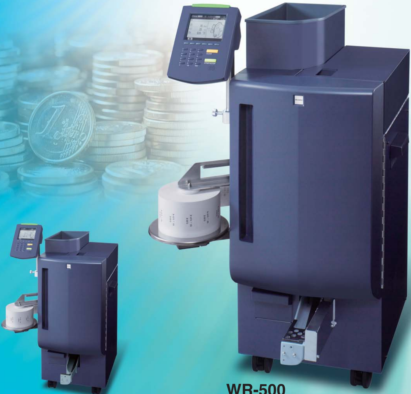
WR-90 Standard model