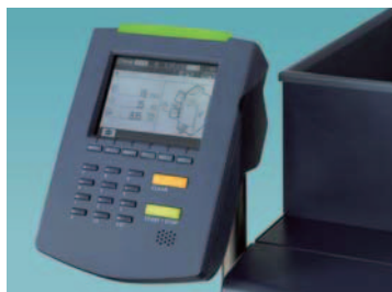
▲ Built-on LCD control panel

With utilization of built-on LCD control panel, screen visibility and operability were improved dramatically. The processing mode and data contents may be checked quickly and easily. Furthermore, easy-to-understand illustrated operation guide provides accurate and applicable support.