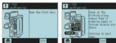
▲ Illustrated operation guidance display